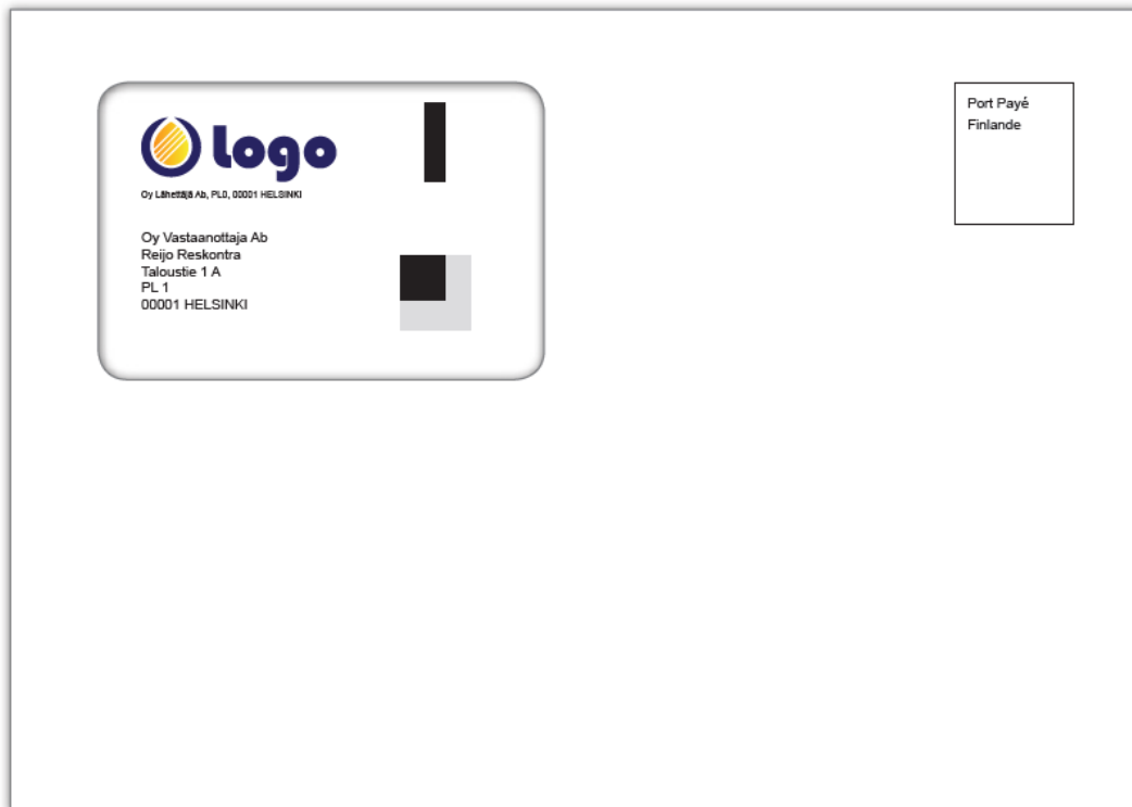
Image 2. We Mail C5 envelope